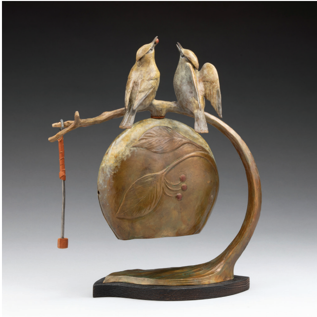
Communion Song bronze ed. of 30 16 x 16 x 5 inches $3,800

“No bird soars too high if he soars with his own wings.” — William Blake