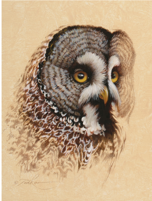
Great Grey Owl acrylic on board 12 x 9 inches $3,100