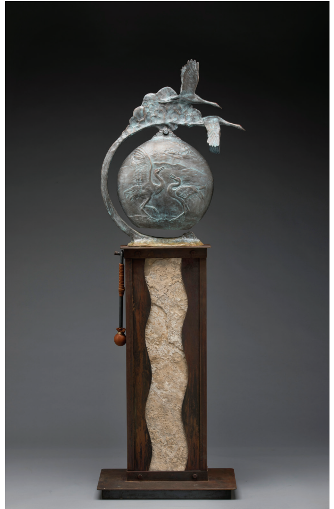
Sandhill Song bronze ed. of 20 53 x 20 x 12 inches $12,650

“No bird soars too high if he soars with his own wings.” — William Blake