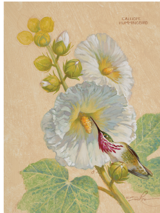
Calliope Hummingbird , acrylic on board 12 x 9 inches, $3,100