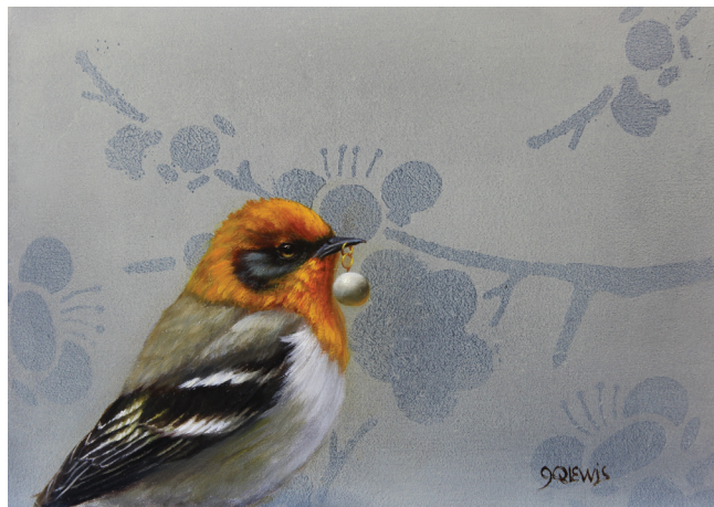
Always , oil on board, 5 x 7 inches, $1,000