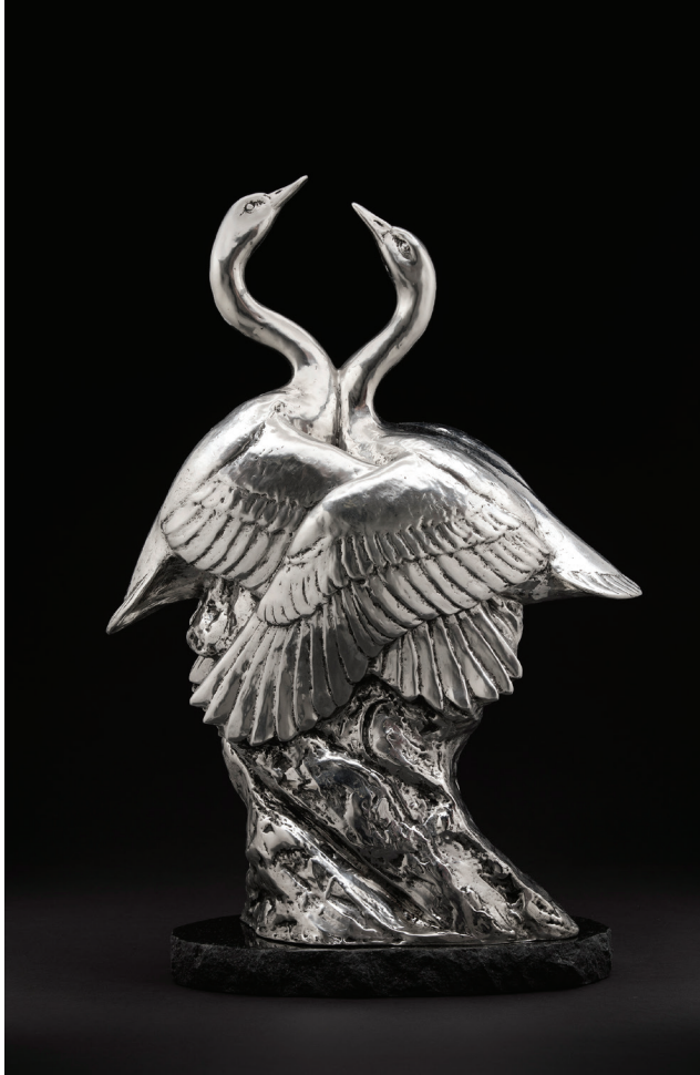
Bonding stainless steel ed. of 12 21 x 13 1/2 x 7 inches $12,000