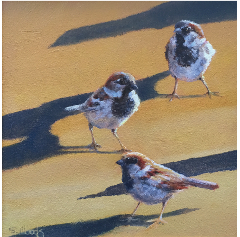
Shadow Play oil on board 9 x 9 inches $1,000