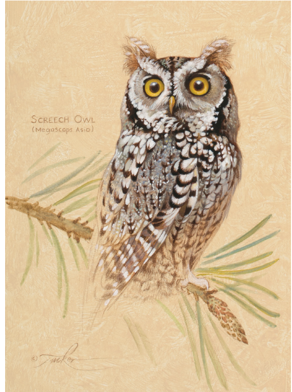
Screech Owl acrylic on board 12 x 9 inches $3,100