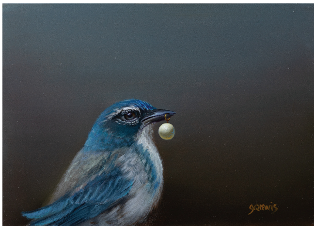
Devotion , oil on board, 5 x 7 inches, $1,000