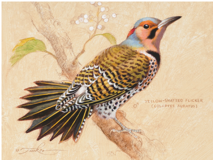
Yellow Shafted Flicker acrylic on board 9 x 12 inches $3,100