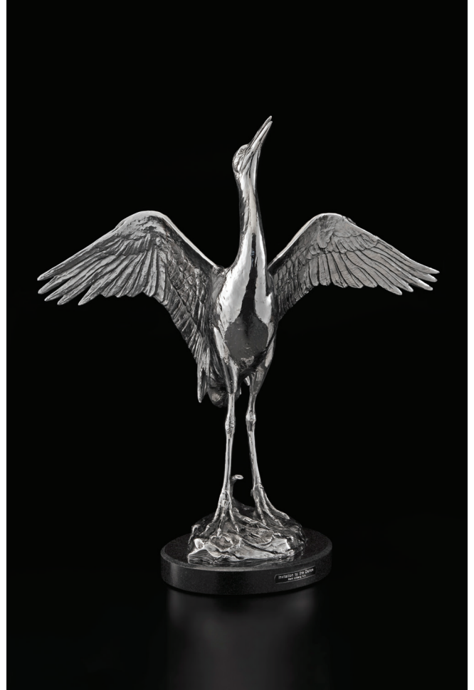
Invitation to the Dance stainless steel ed. of 12 20 x 20 x 9 inches $9,000