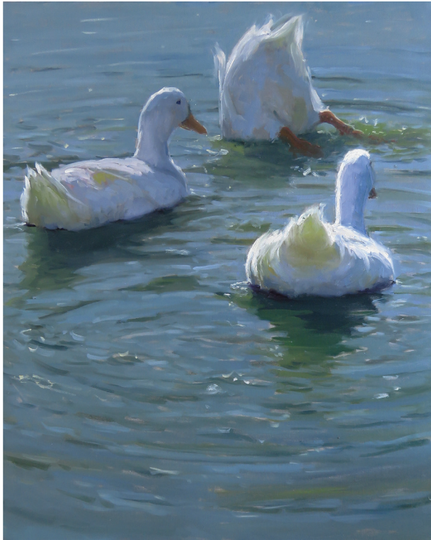
Bottoms Up oil on linen 30 x 24 inches $7,500