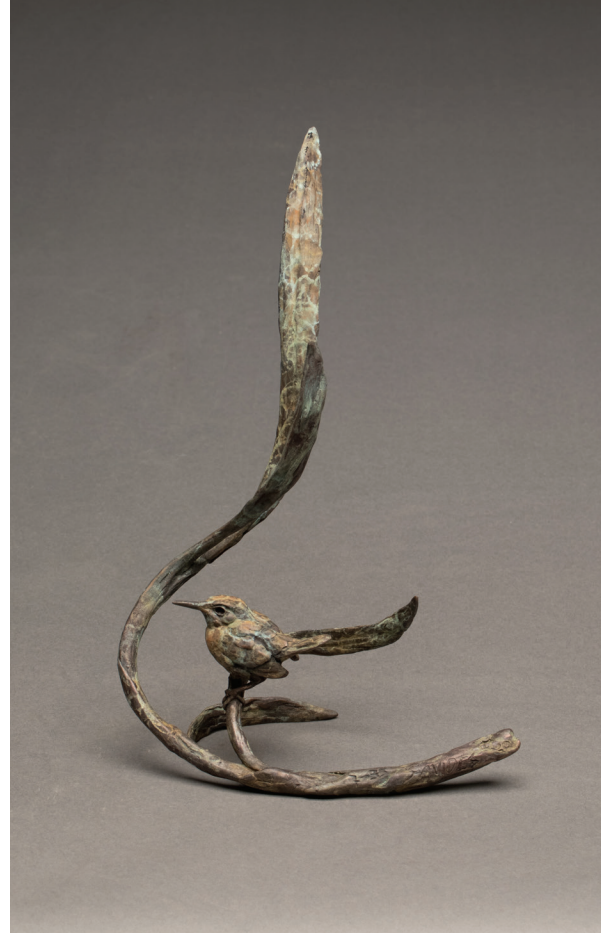
Wren's Day bronze ed. of 35 11 x 7 1/2 x 5 inches $1,800