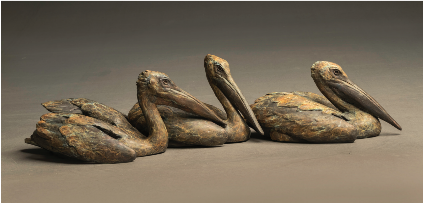
Tres Pescadores bronze ed. of 35 6 x 23 x 8 inches $3,100