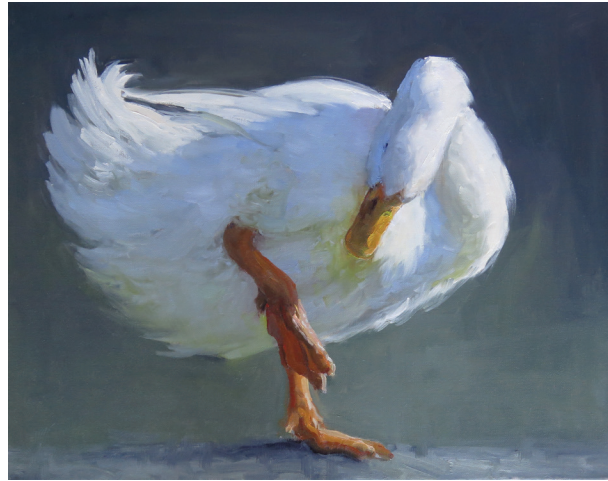
Preen , oil on linen, 16 x 20 inches, $3,800