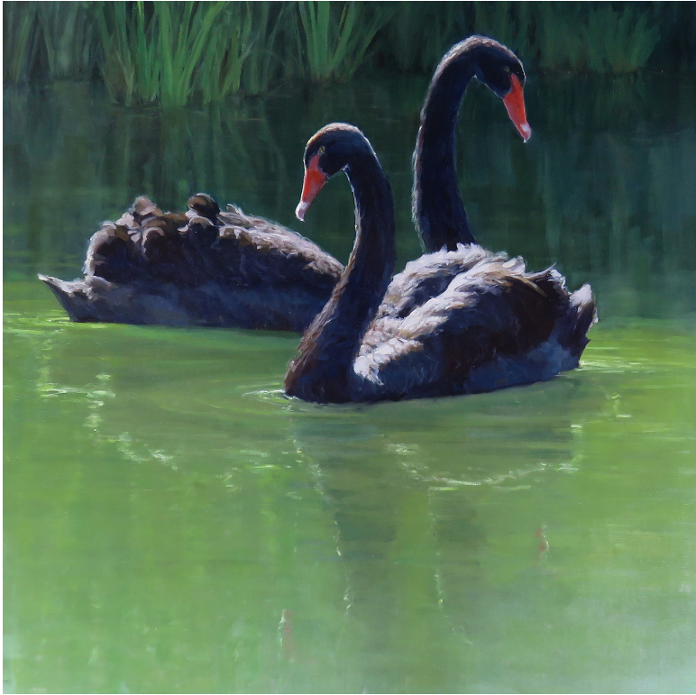
Inamorata oil on linen 44 x 44 inches $19,000