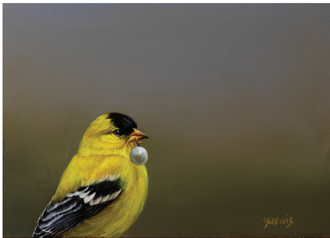
Surprise , oil on board, 5 x 7 inches, $1,000