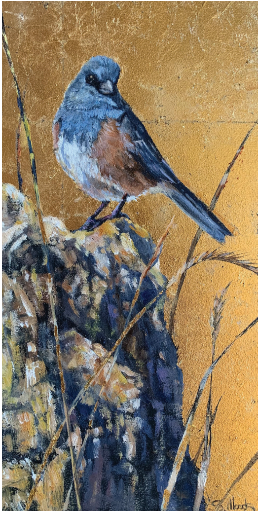
Dark Eyed Beauty oil with gold leaf 12 x 6 inches $950