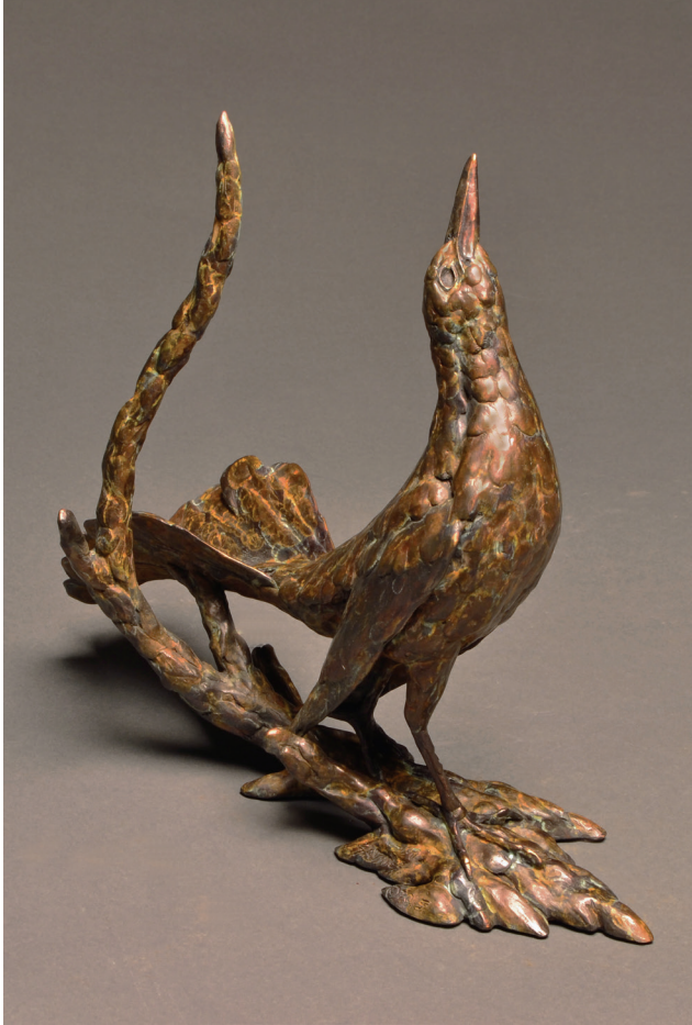
Attitude Is Everything bronze ed. of 9 12 x 13 1/2 x 5 inches $1,800