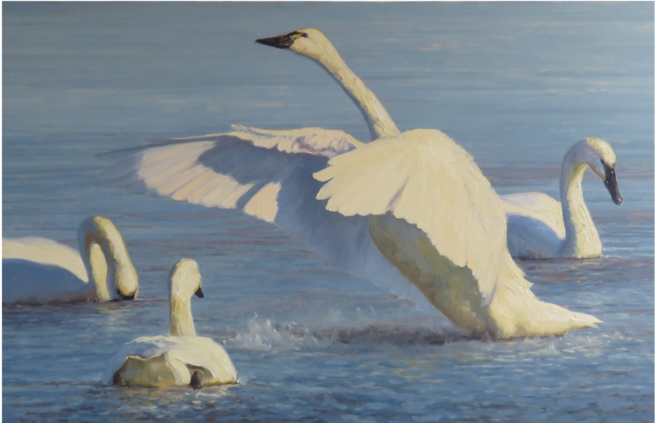
Wingbeats oil on linen 36 x 56 inches $18,750