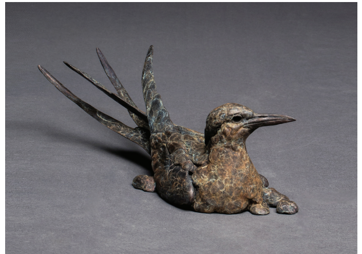
Globetrotter bronze ed. of 35 4 x 14 x 5 inches $1,800