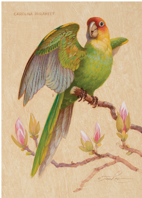
Carolina Parakeet , acrylic on board 12 x 9 inches, $3,100