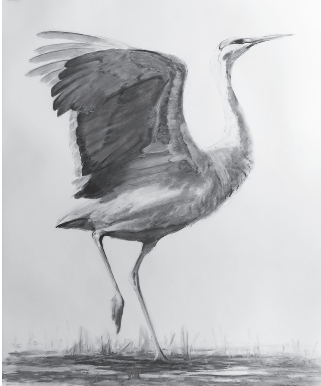
Song of Myself charcoal on stonehenge paper 47 x 40 inches $11,000