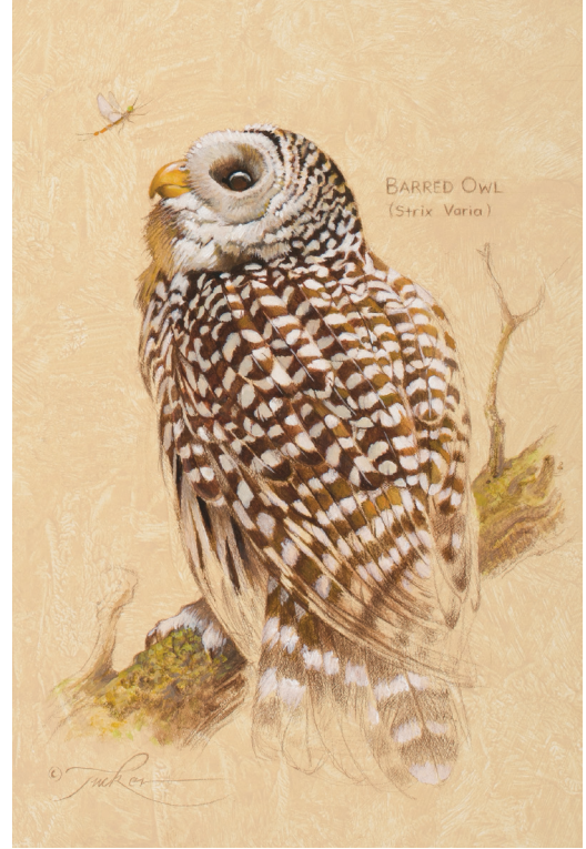
Barred Owl acrylic on board 12 x 9 inches $3,100