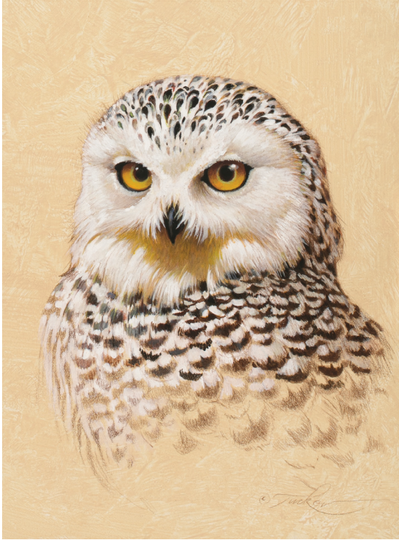
Snowy Owl acrylic on board 12 x 9 inches $3,100