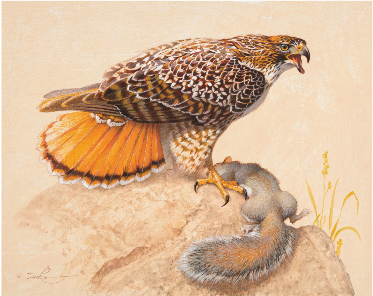
Red-tailed Hawk and Grey Squirrel , acrylic on board, 16 x 20 inches, $6,500

“The reason birds can fly and we can’t is simply because they have perfect faith, for to have faith is to have wings.” — J.M. Barrie