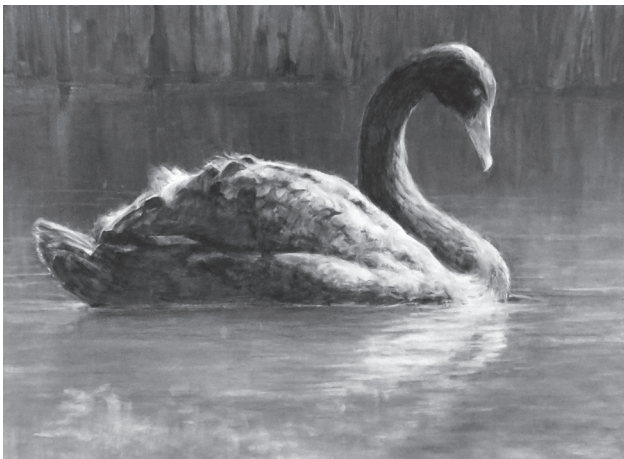
Black Beauty charcoal on paper 18 x 24 inches $3,700