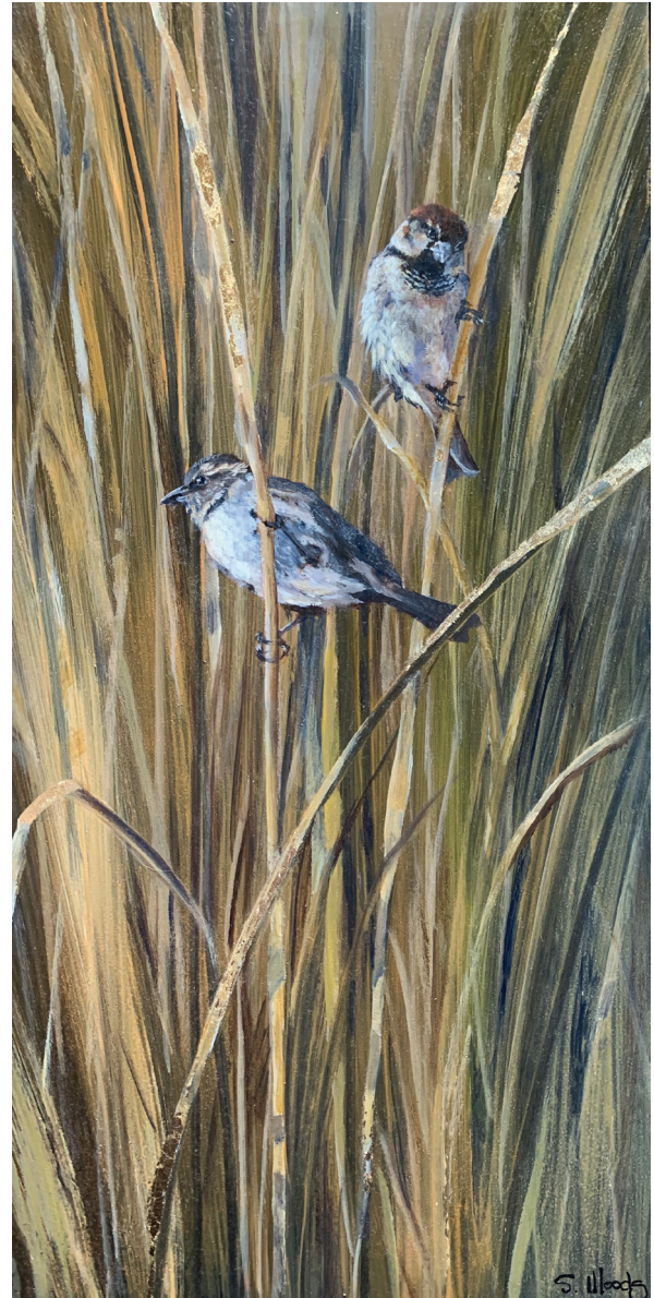
Gilded Grasses oil with gold leaf 20 x 10 inches $2,000