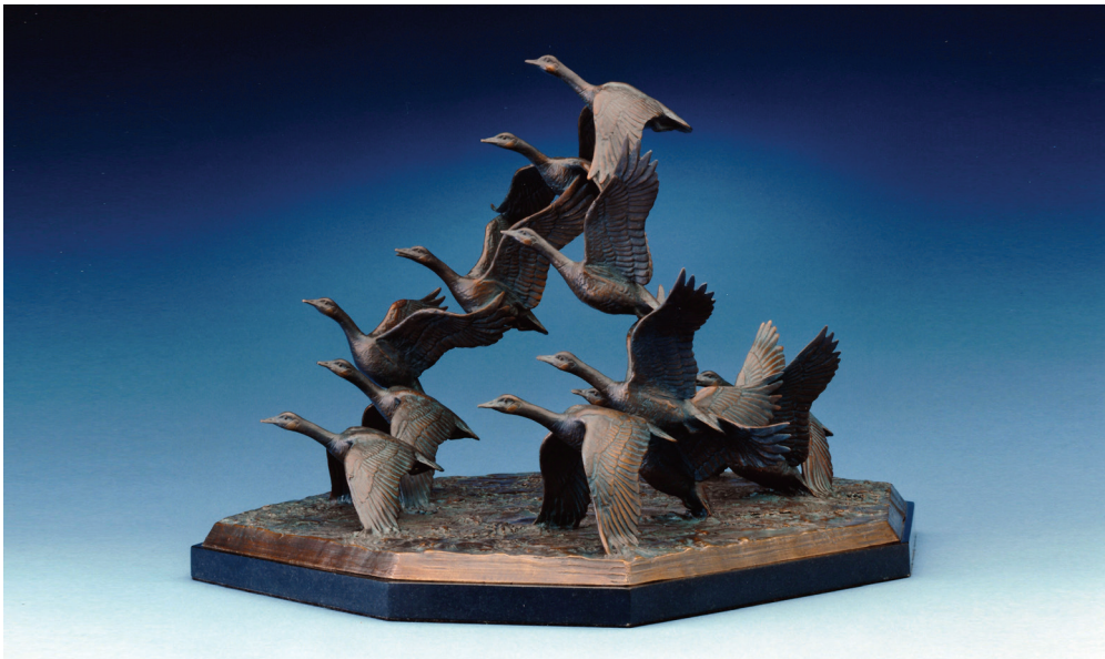
Great Arch , bronze ed. of 25, 12 x 17 x 17 inches, $5,500