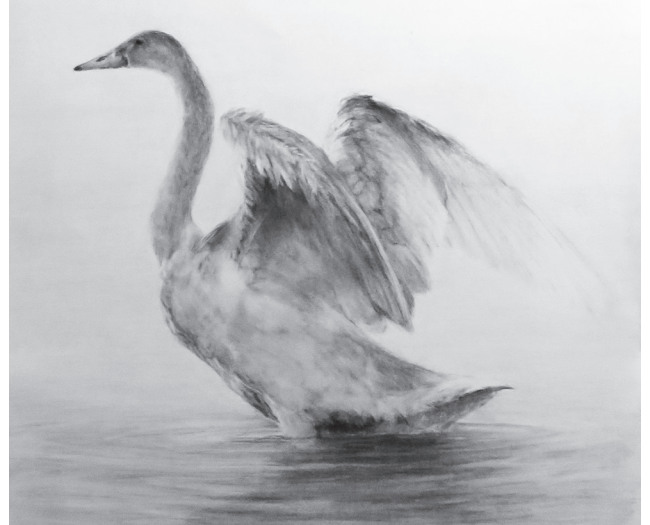
Study for Wing and a Prayer charcoal on paper 28 x 31 inches $6,000

“Birds have wings; they can fly where they want when they want. They have the kind of mobility many people envy.” — Roger Tory Peterson