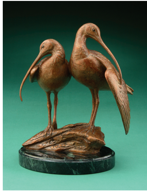
Preening Curlews , bronze ed. of 50, 12 x 9 1/2 x 6 1/2 inches, $3,000