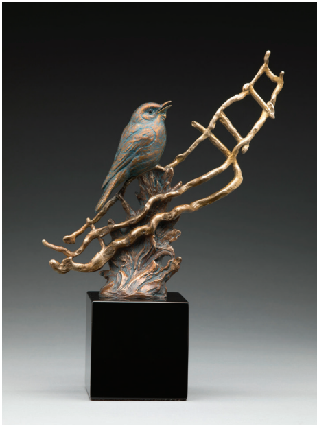
Bluebird Sings , bronze ed. of 12, 15 x 11 x 4 inches, $2,500