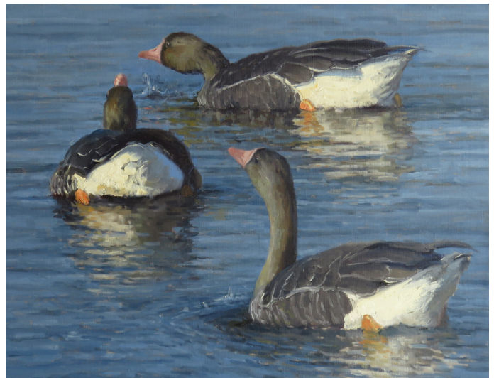
Drinking Buddies , 26 x 30 inches, oil on linen, $7,500